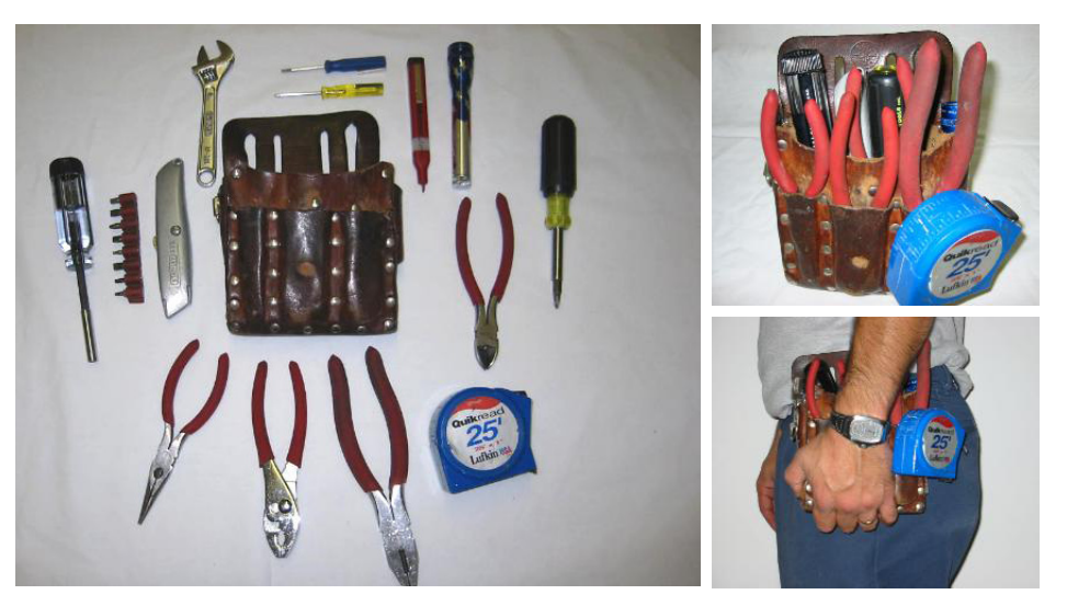
"By having a basic tool pouch, you have enough power to evaluate a complaint if not fix it."

Many times the work that we do requires only the basic tools, so there is no need to carry Mr. big pouch. Most of the time guestroom repairs require that you go back