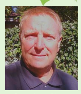
By Art Attaway

Some of these items are specifically engineering issues while others cross-over to other operating departments within the hotel. However, to be truly effective and efficient in their efforts, each property has to come together as a team to accomplish the overall goals of sustainability and help each other along the way.