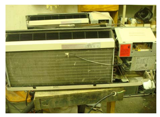
The routine cleaning of your HVAC coils will remove contaminants, some even containing mold and fungus.

¼" poly media over PTAC coils by using Velcro for better filtration. Poly media is inexpensive, easy to work with and disposable. Talk about a labor saver! og